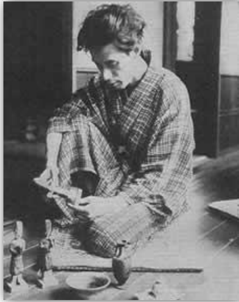
Author Ryunosuke Akutagawa

Therefore, Akutagawa had to take care of his debt and his family. In the same