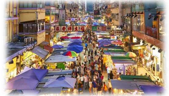
Ladies Market along Tung Choi Street

Hong Kong is a very nice place to visit, so please try to go there.