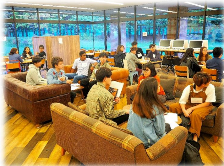
Students give their thoughts and opinions about the late Donald Keene.

He came up with a unique name to make people laugh, accord-