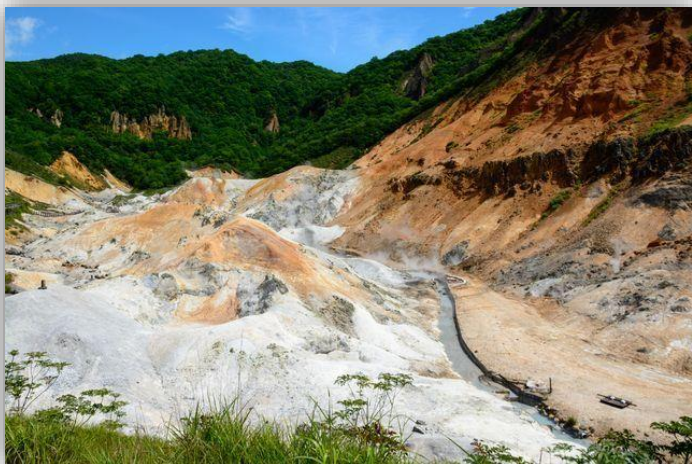
Noboribetsu Hot Spring in Hokkaido

Lake Toya is regarded as one of Hokkaido's three great scenic areas for its beautiful lake views that change from morning to evening.